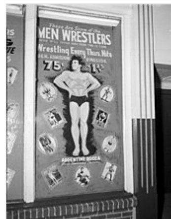
A Jacksonville, Florida, poster advertises Rocca